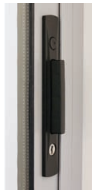
Handle in open position