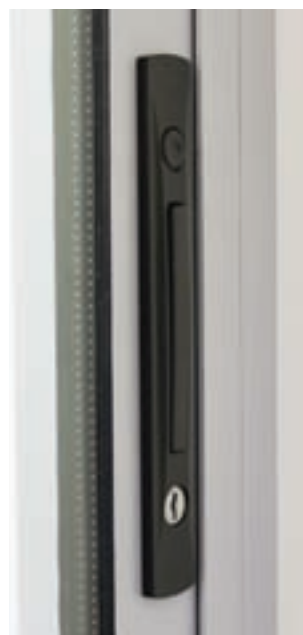
Handle in closed position