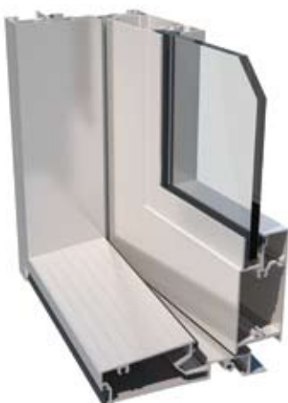
LSS-517 Weathershield™ Inward Opening Door Threshold