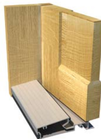
Weathershield™ Threshold with timber door and frame