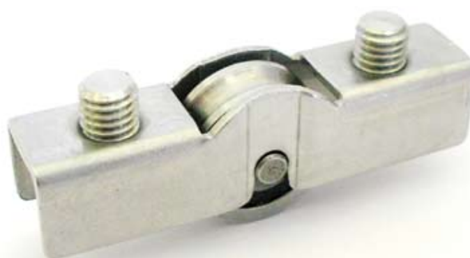
01-029M Stainless Steel Window Roller